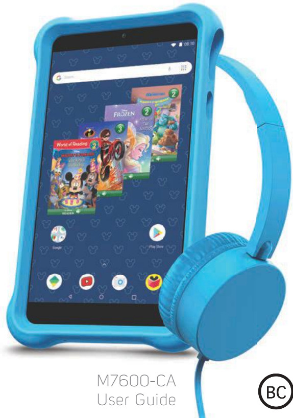
M7600-CA User Guide